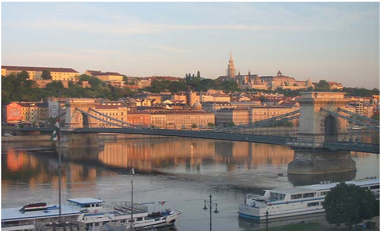
Blue Danube and the Chain Bridge